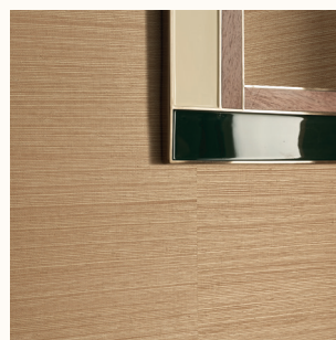
LUMBI, KIM 3 Tone-on-tone sisal weave