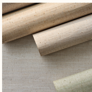
TANGAÏ, KIM 6 Weave of paper and raffia