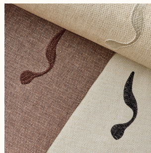
LOKEMA, KIM 7 Embroidered paperweave