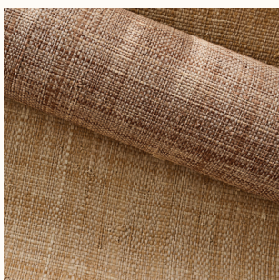
KOROO, KIM 5 Raffia weave