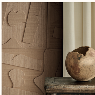
KISA, KIM 2 Relief module, 44x44cm, Tone-on-tone sisal weave